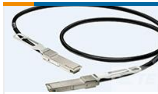
TE Part # 2829040-7 QSFP IB EDR, 26AWG, 2.0M