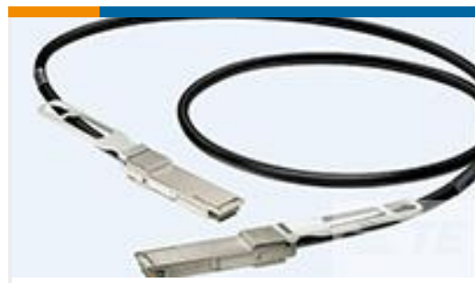
TE Part # 2829040-6 QSFP IB EDR, 30AWG, 2.0M