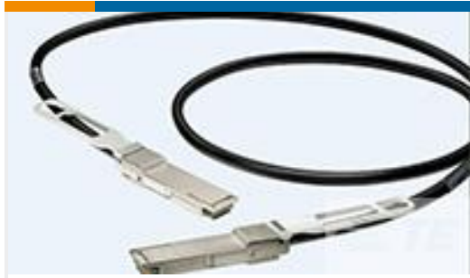
TE Part # 2829040-8 QSFP IB EDR, 26AWG, 3.0M