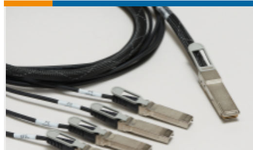
TE Part # 2821033-8 QSFP TO [4]SFP+, 28G, 1M, 33AWG