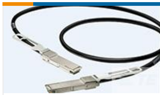
TE Part # 2829040-4 QSFP IB EDR, 30AWG, 1.0M